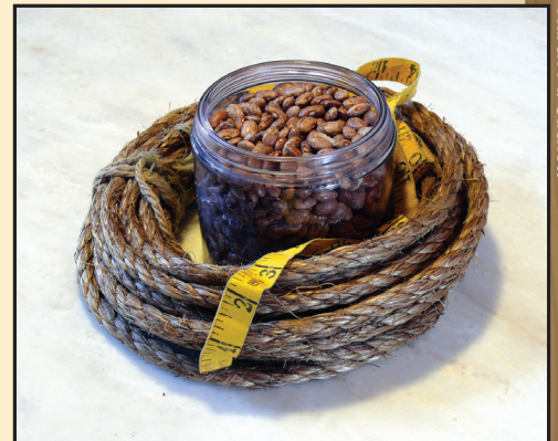
Karen M. Sackett

What about the jar of beans? Another amazing and scary fact is that each mature yellow toadflax plant can produce up to 50,000 seeds in one year. To show what 50,000 looks like, ask a classmate to help you fill a jar with 1000 beans. How many more jars of the same size would you need to have 50,000 beans?