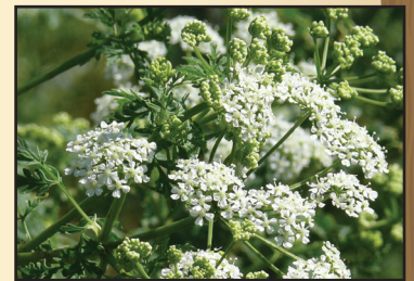
Poison hemlock in bloom

4. Develop and distribute a Bounty Hunter list of noxious weeds for your county.